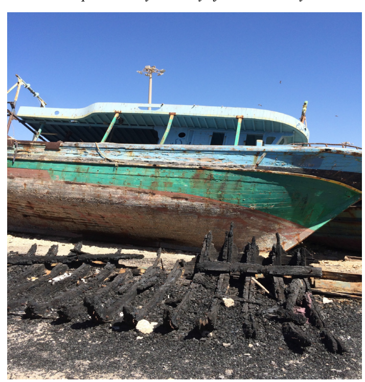
Picture 2: Porto Palo, Italy, cemetery of boats.

On that windy morning, we went hunting for the objects and fragments of boats that were abandoned at the damp. Many things cross with the humans, and sneak in the shores of Europe otherwise, leaking out of the