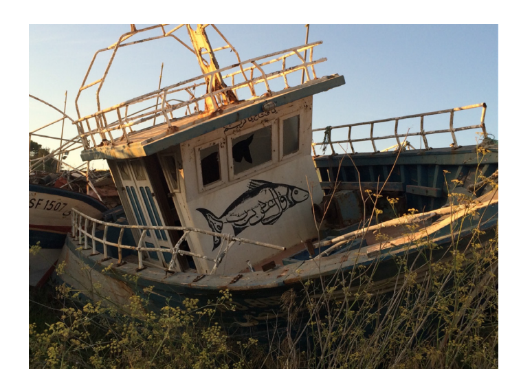
Picture 1: Lampedusa, Italy, cemetery of boats.