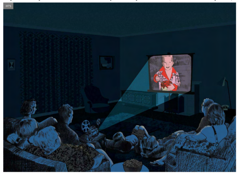
Figure 5. A family video is shown in 1973 (McGuire, 2014 © Pantheon Books)

Are [...] human tragedies small and insignificant against the backdrop of geological time? Are they the stubborn and unconscious efforts of humans to make a mark on the hugeness of existence? Are the minutiae of human history being celebrated, mocked, or both? [...] the smallness of human accidents and accomplishments is sandwiched between a vast, unknowable past and a precarious, environmentally catastrophic future. (Moncion, 2017, p. 207)