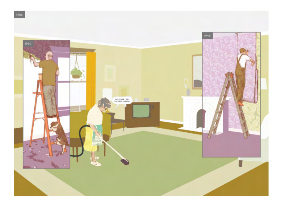
Figure 6. Scraping off old wallpaper, putting on new wallpaper, and wondering how memory works (McGuire, 2014, pp. 62-63).

However, more can be said about this image, as the two inset panels stand in the foreground of the main 1986 spread page, where the dominant green, the uniform color of the paint on the walls and the carpet on the floor, is similar to those of the wallpaper that was being covered in 1949 and resurfaced with the scraping in 1960.