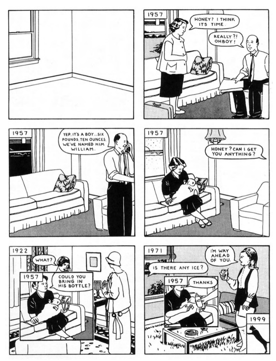
Figure 1. The first page of "Here" (McGuire, 1989 © RAW)

The two main inspirations were Art Spiegelman's The Malpractice Suite , a two-page comic with multilayered panels published in 1976 in the magazine Arcade: The Comics Revue ; and Robert Crumb's A Short History of America , a 15-panel (originally 12) one-page comic first published in the CoEvolution Quarterly magazine in 1979, depicting the same corner of America grappling with industrialization over the years.<sup>2</sup>