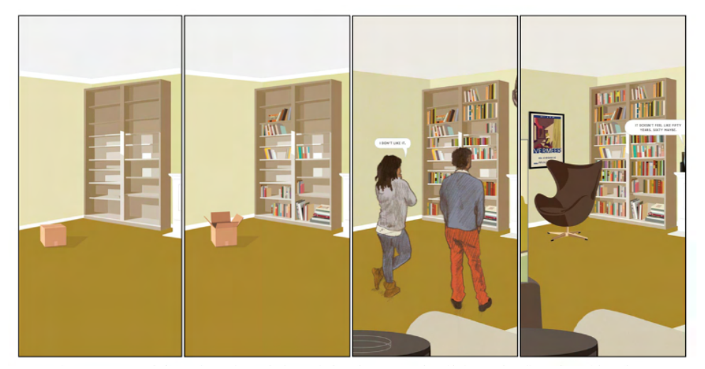
Figure 4. My elaboration: from left to right, the same detail from the first, last (dated 2014), and middle pages of the book (dated 2015) (McGuire, 2014, pp. 6-7, 300-01, 94-95, 210-11 © Pantheon Books).

However, an opposite movement comes from reconstructing the chronological progression: the bookcase in 2014 turns out not to be the (fictional) McGuires'. It is instead owned by the young couple who must have bought the house when McGuire senior died: we witness them unconvincingly furnishing the room in 2015 (McGuire, 2014, pp. 210-11), and we see, the same year, the same bookcase filled with books, and next to it the Vermeer exhibition poster that was missing during the moving in/furnishing phase (2014, pp. 94-95). The fact that the bookcase is theirs means that the apparent closure is not conclusive, but rather only part of a circular loop: another story starts from the end of the McGuires', which the book already partly tells: the story, in this sense, symbolically overcomes itself, crossing its own boundaries.