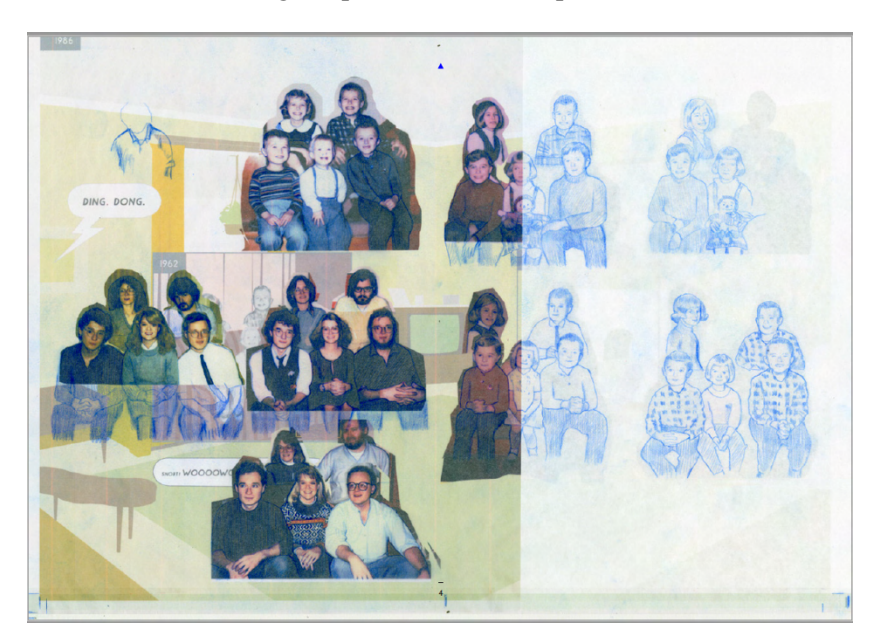
Figure 7. Preparatory page for Here (McGuire in Smith, 2015, n.p.)

As these themes resonate in the comic, they result in a feeling of subjectivity and grief that pervades the work and compensates for the dilution of story time over a much longer period than the human life, foregrounding inherently nostalgic reflections on the cyclical and irreparable nature of passing time (Salmose, 2012; Busi Rizzi, 2018, 2023). These reflections are universal, yet so deeply ingrained in anybody's personal experience that they further lure the reader in, setting the premises for a deeper emotional involvement.